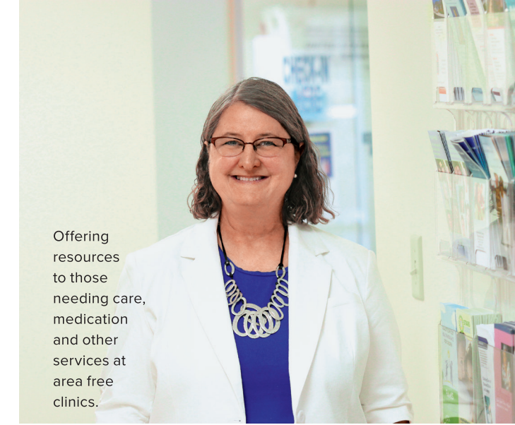
Offering resources to those needing care, medication and other services at area free clinics.