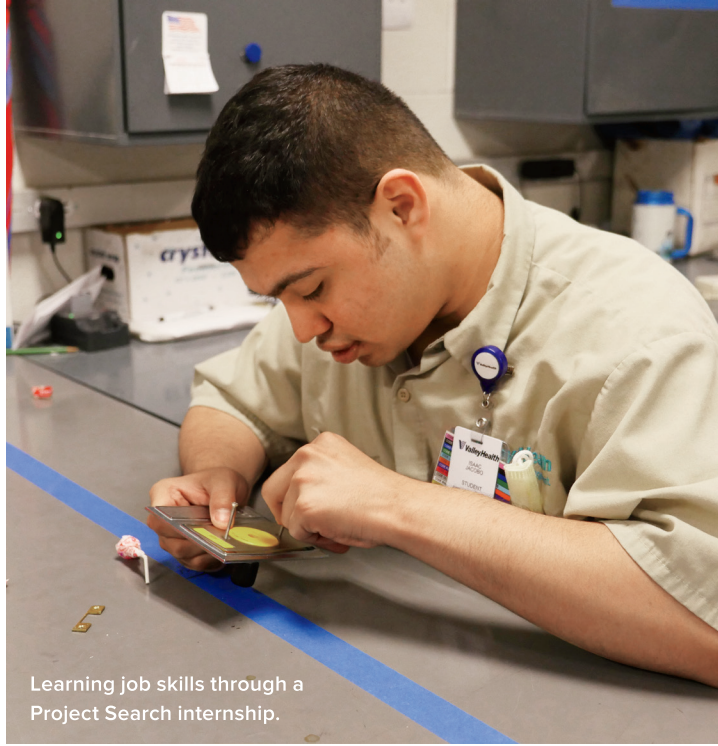
Learning job skills through a Project Search internship.

On the cover: Two local youths are all smiles after fittings for free bicycle helmets at a local Valley Health health and safety event.