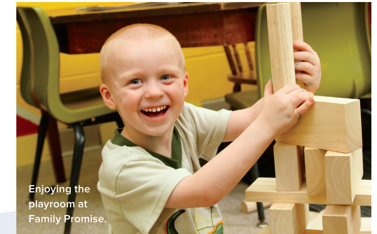
Enjoying the playroom at Family Promise.

Substance abuse, mental illness and social welfare challenges impact the health and well-being of many in our community, and partnering with local stakeholders to address these needs allows Valley Health to multiply its effectiveness in these arenas. The team at Shenandoah Memorial Hospital collaborates with the Northwestern Community Services Board to offer free Mental Health First Aid training, and Valley Health’s partnership with the Northern Shenandoah Valley Substance Abuse Coalition supports efforts involving education, counseling, health care, and law enforcement to prevent and treat addiction. Valley Health provides thousands of dollars in grants and/or gifts in kind to “safety net” organizations such as The Laurel Center (domestic violence) and Healthy Families (family and child welfare) because the provision of quality care means corralling all available resources to care for the whole person.