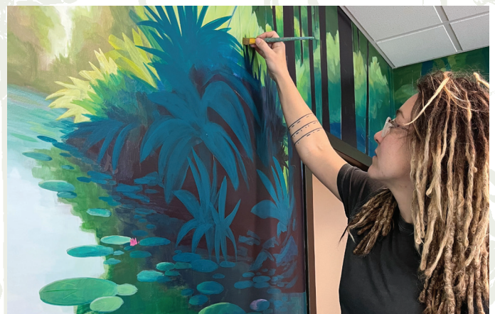
The jungle scene with glow in the dark paint (above) is a special room in the Diagnostic Center created to ease the nerves or fears from children while getting their blood drawn.