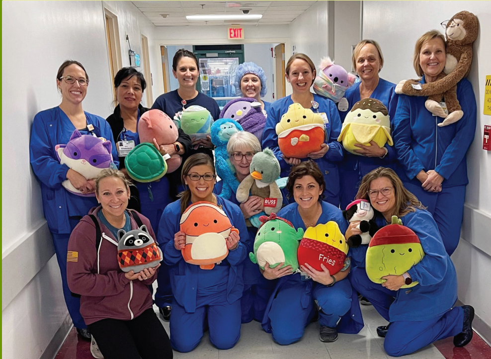
Generous donation of Squishmallows (above) given to WMC from Jazwares to help comfort children post-surgery. Local family (below) enjoying a spring day at the Valley Health Cancer Center at our Inaugural Cancer Survivor Day celebrations.

Stronger Together, a comprehensive, system-wide campaign to improve heart health, mental health, and community health, was launched during 2024. The projects and programs supported by the Strong Together campaign will allow our families, friends and neighbors to live healthier lives.