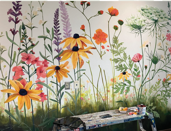
The floral mural (above) brightened the lobby of the Breast Center to lift spirits of patients and their families.