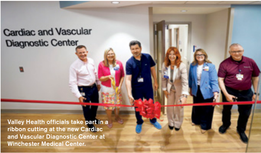
Valley Health officials take part in a ribbon cutting at the new Cardiac and Vascular Diagnostic Center at Winchester Medical Center.