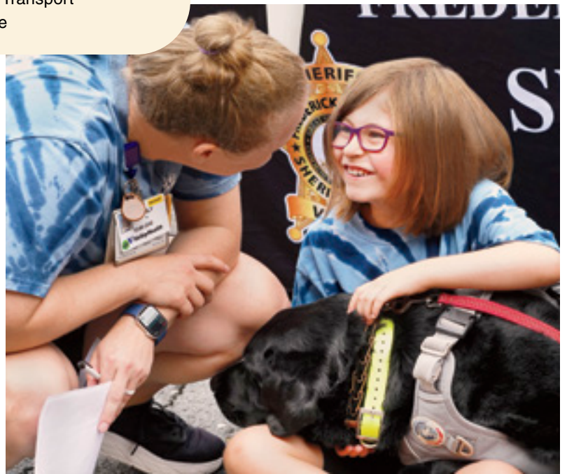
Kids at Camp Follow the Leader meet service animals, along with EMS and fire and law enforcement officials during the weeklong event.

For more information, please visit valleyhealthlink.com/campfollowtheleader .