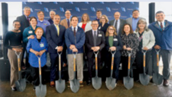
Left: Participants take part in a May groundbreaking ceremony for the Valley Health Behavioral Health Pavilion. Below: A rendering of the Behavioral Health Pavilion, set to open in 2026.