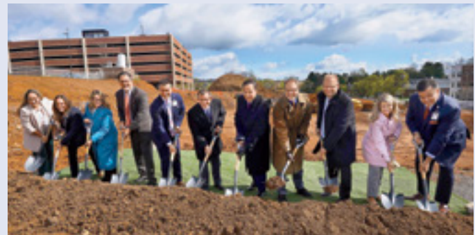
Top: Valley Health celebrates the future Valley Health Winchester Medical Center Mary Free Bed Rehabilitation Tower at a groundbreaking event in July. Right: The 101,506-square-foot rehabilitation tower will offer patients advanced care.